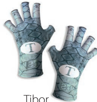
Tibor Guide Gloves