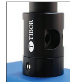
Push Pole Caddy QuickRelease