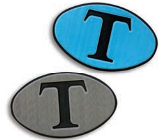
Tibor Fly Patch