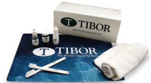
Cleaning & Lubrication Kit