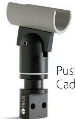
Push Pole Caddy